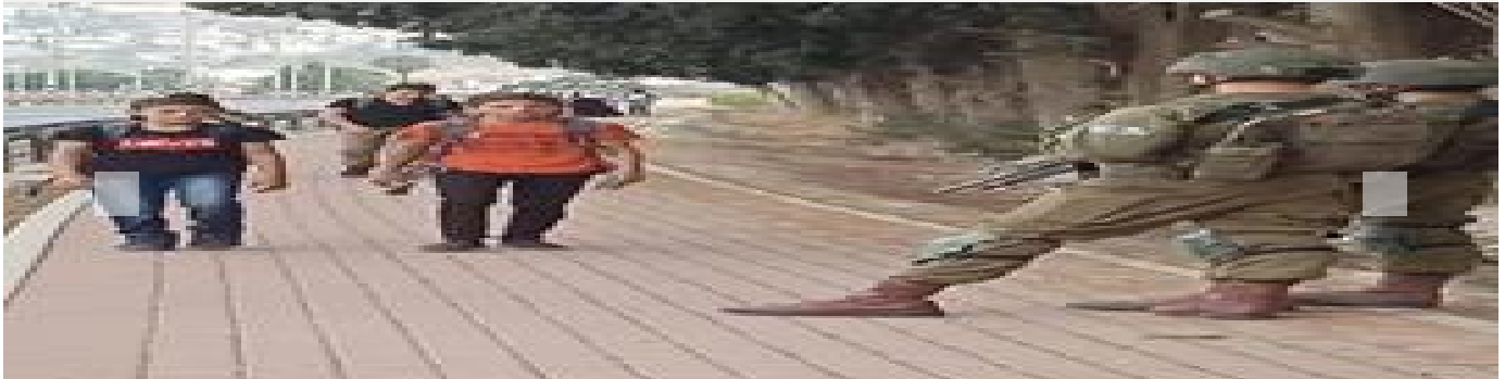
Israeli forces obstruct students' access to school south of Nablus